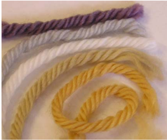
Fig 1: Merino wool yarn coloured with gold particles of difference sizes and colours