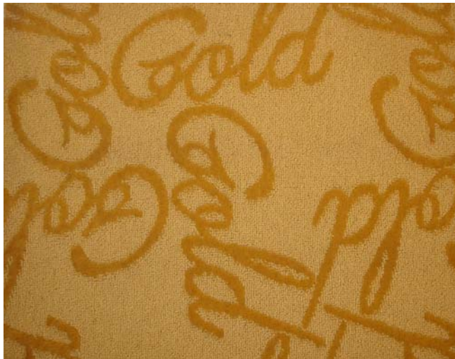
Fig 3: Gold coloured carpet