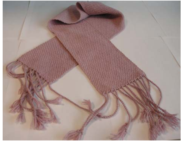
Fig 2: Merino wool scarf coloured with purple gold